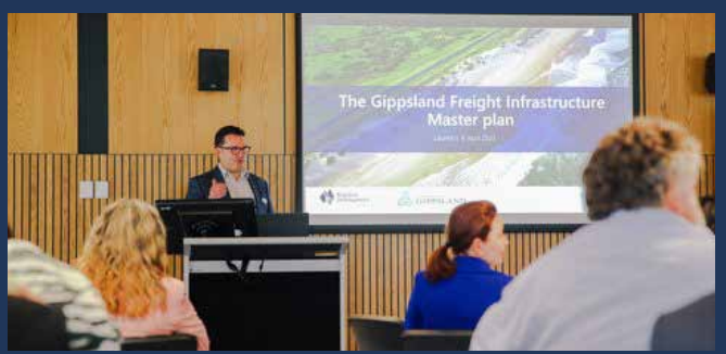
The 2023 GFIMP was launched at the Morwell Innovation Centre in April.

The 2023 GFIMP is a refresh of the 2013 edition which serves as a strategic planning tool to support investment attraction into the region.